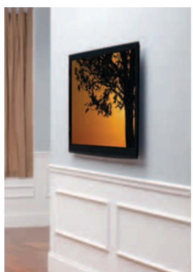
Solution: Exclusive ProSet™ technology allows height and leveling adjustments after the TV is mounted.